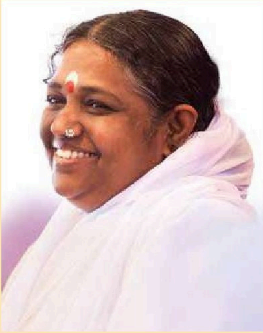
Sri Mata Amritanandamayi Devi

There are two types of Education Education for Living. Education for Life.