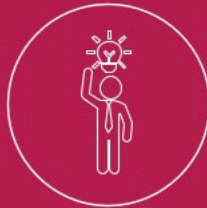
Personal Finance Consultant