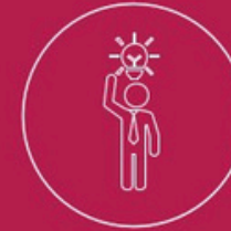
Business Development Trainee