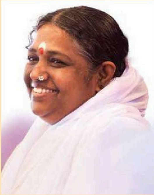
Sri Mata Amritanandamayi Devi

There are two types of Education Education for Living. Education for Life.