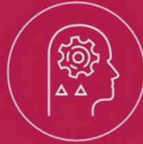
Human Resource Manager