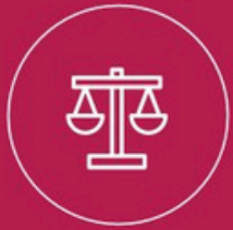
Territorial Sales Manager