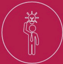
Business Idea Developer