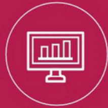
Information Systems Manager