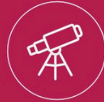
Research & Development Manager