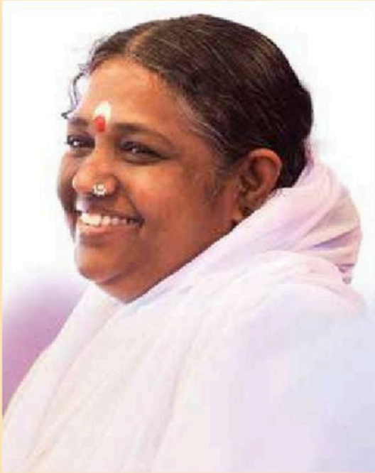
Sri Mata Amritanandamayi Devi

There are two types of Education Education for Living. Education for Life.