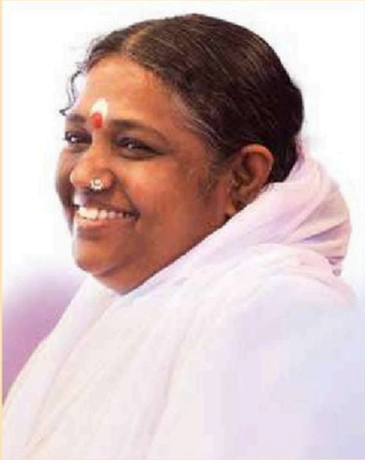
Sri Mata Amritanandamayi Devi

There are two types of Education Education for Living. Education for Life.