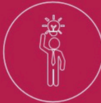
Personal Finance Consultant