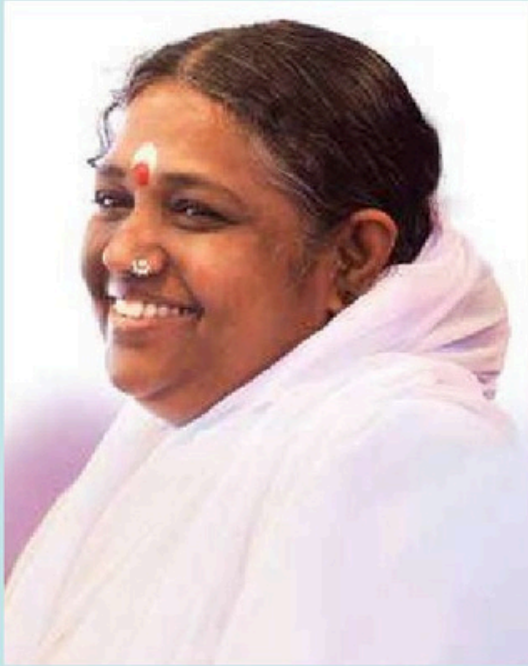
Sri Mata Amritanandamayi Devi

There are two types of Education Education for Living. Education for Life.