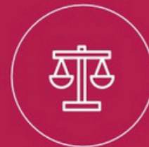
Territorial Sales Manager