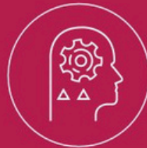
Human Resource Manager