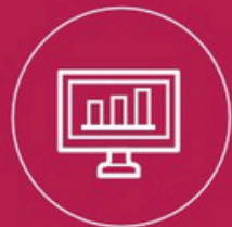
Information Systems Manager