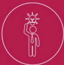
Business Idea Developer