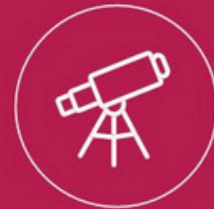
Research & Development Manager