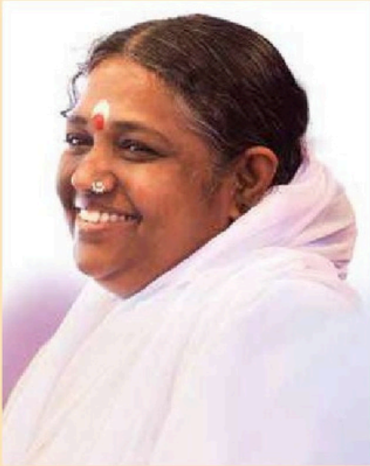
Sri Mata Amritanandamayi Devi

There are two types of Education Education for Living. Education for Life.